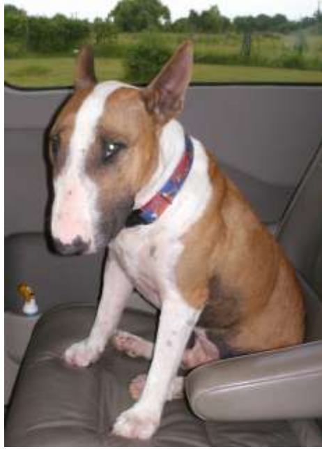
Frankie wants to go for a drive!