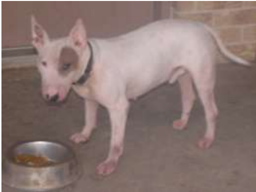
Buck putting on some weight