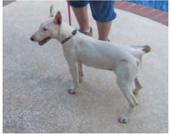
Belle .... Looking much better already!