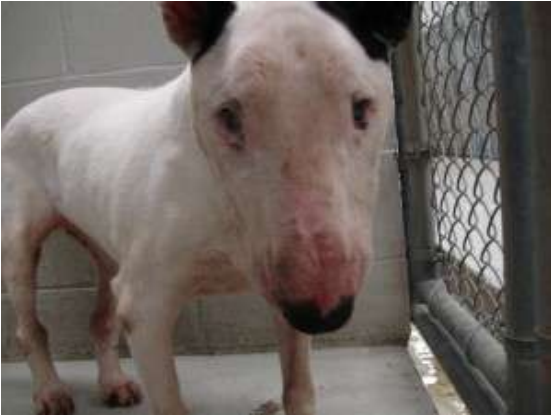
Butler needing Rescue