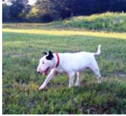
Enjoying the sunshine