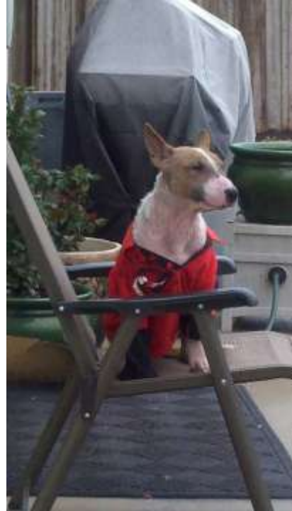
Bambi on arrival ... and looking better already