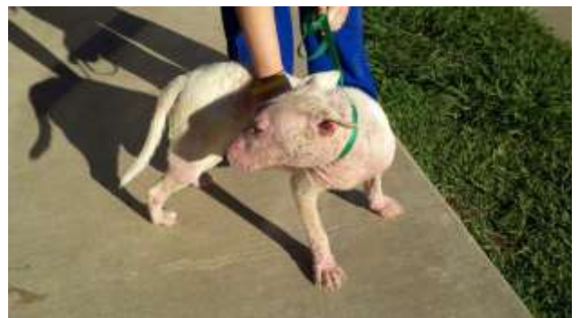
Gabby on arrival at Grand Park